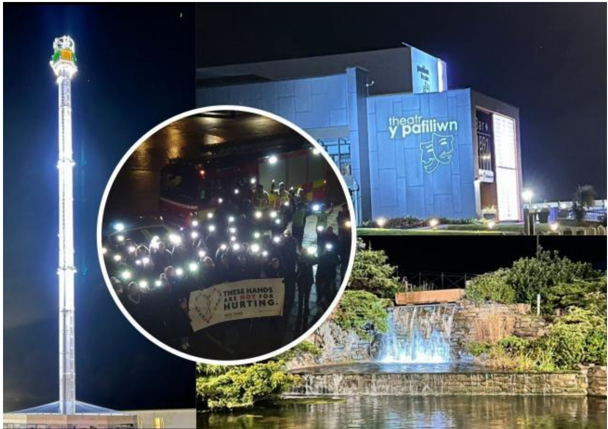
Photograph shows the landmarks and the Vigil held 25 th November 2021